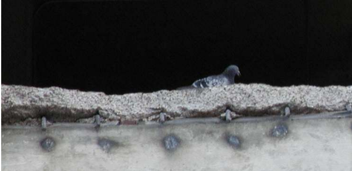
5 6 7 8 9 10 11 12 13 14 15 16 17 Figure 2

1 The rebar is located on the outside of the “neutral axis” of the spandrel. The neutral axis is an 2 3 4