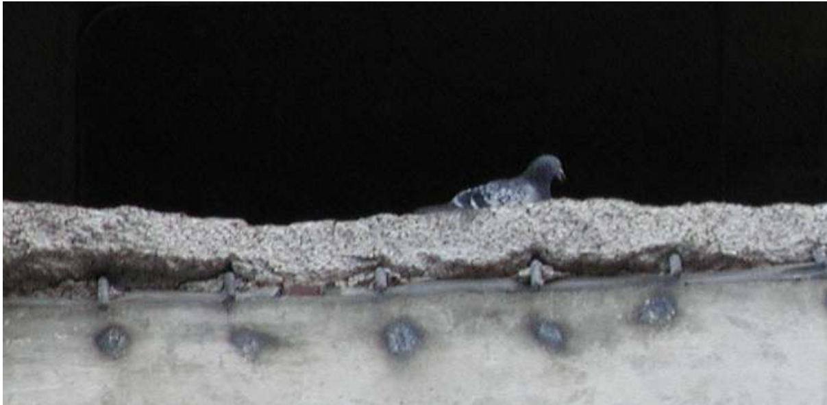
5 6 7 8 9 10 11 12 13 14 15 16 17 Figure 2

1 The rebar is located on the outside of the “neutral axis” of the spandrel. The neutral axis is an 2 3 4