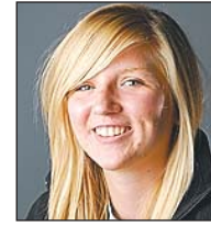
DEVIN DEVINE Staff Reporter WEST VALLEY

Big, broad-shouldered boys are the one and only thing I care about when it comes to football.