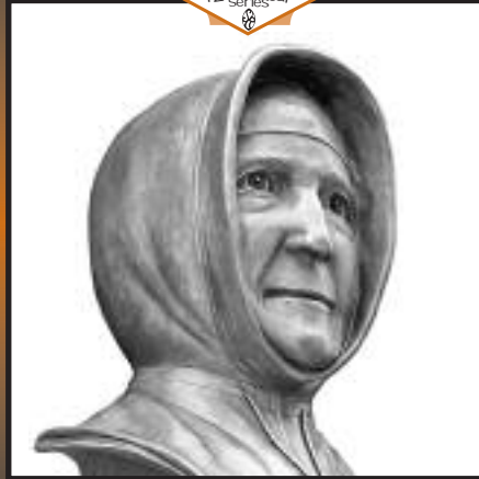
MOTHER JOSEPH Architect, Religious Leader, Hospital Builder